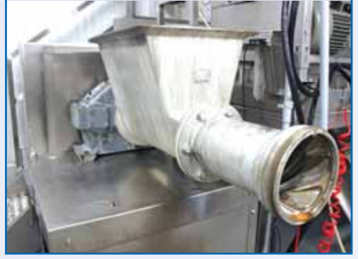
WEILER 868 50 HP MEAT GRINDER