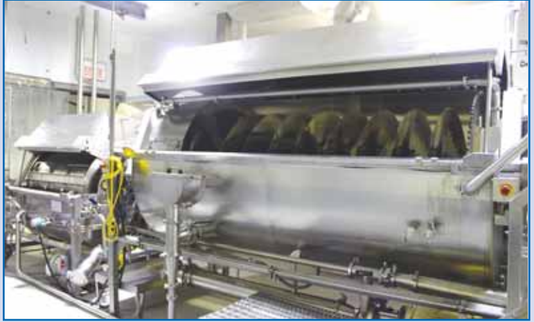
(3) COMPLETE FRESH PASTA PRODUCTION LINES INCLUDING 2007 LYCO CLEAN-FLOW SYSTEM

Piazza Tomasso International 20425 Avenue Clark Graham, Baie D'Urfé, (Montreal), Quebec, Canada Late Model Prepared and Frozen Italian Foods Manufacturing Facility