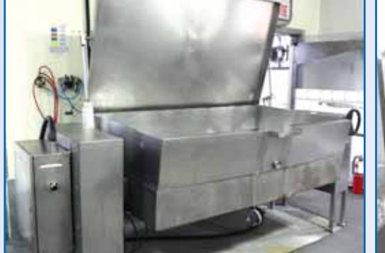
(2) LARGE ELECTRIC TILT BRAISING TABLES