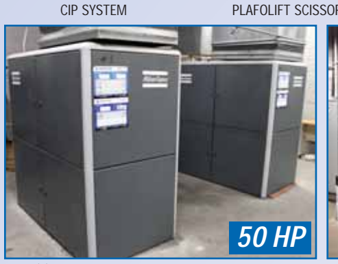
(2) ATLAS COPCO GA37FF AIR COMPRESSORS