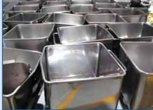
(40+) KOCH 400 LB BUGGIES