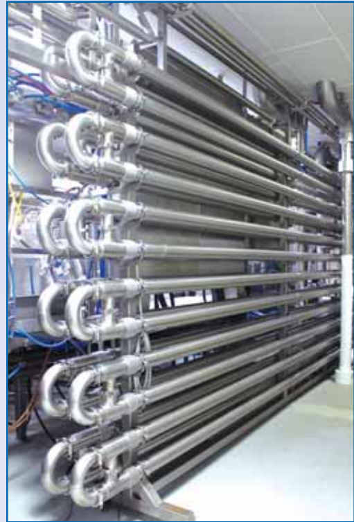
WCB 12-PASS TUBE IN TUBE PASTEURIZER

ESCAN 400 GALLON COOK/COOL TWIN AGITATED SWEEP SCRAPE TILT POUR KETTLE WITH CENTER BOTTOM OUTLET