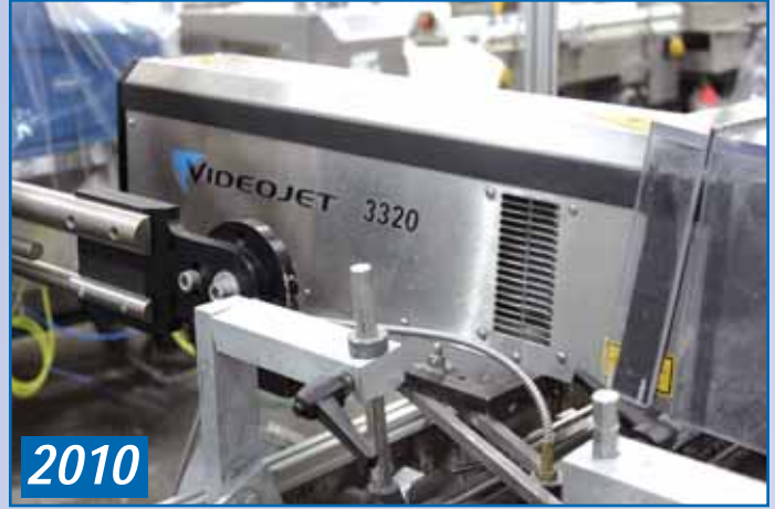
(3) 2010 VIDEOJET 3320 LASER CODERS