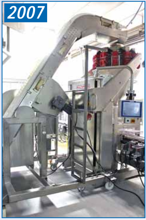
2007 MULTIPOND SCALE SYSTEM