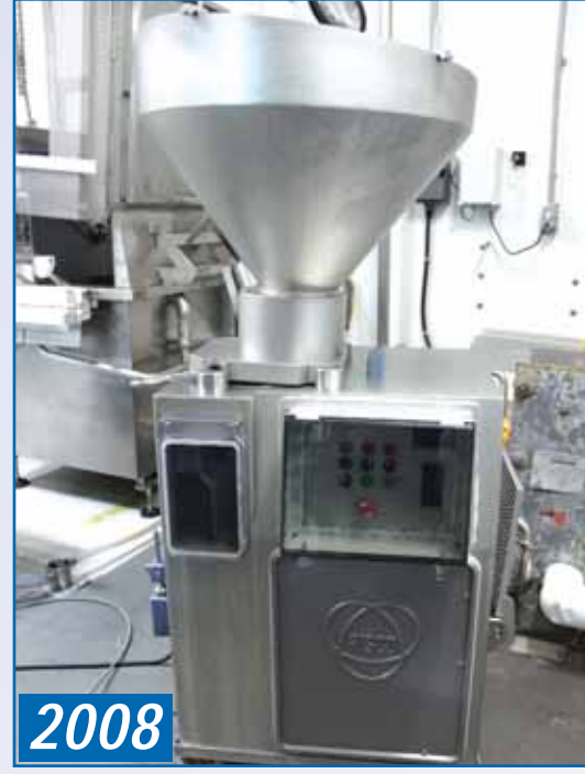
2008 RISCO RS 205/80 VACUUM STUFFER