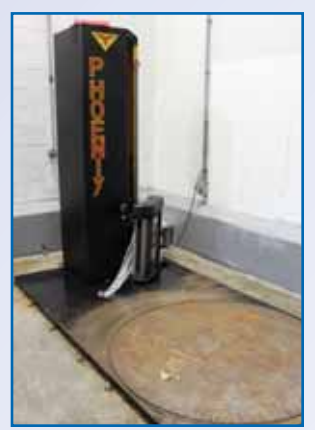
PHOENIX PALLET WRAPPER