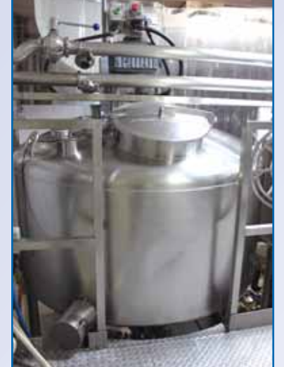
(3) MUELLER SWEEP SCRAPE PROCESSORS