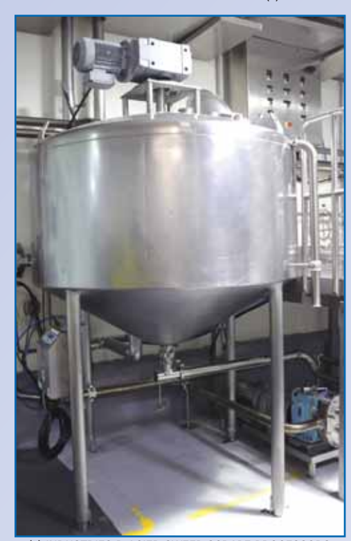
(2) INDUSTRIES D'ACIER SWEEP SCRAPE PROCESSORS