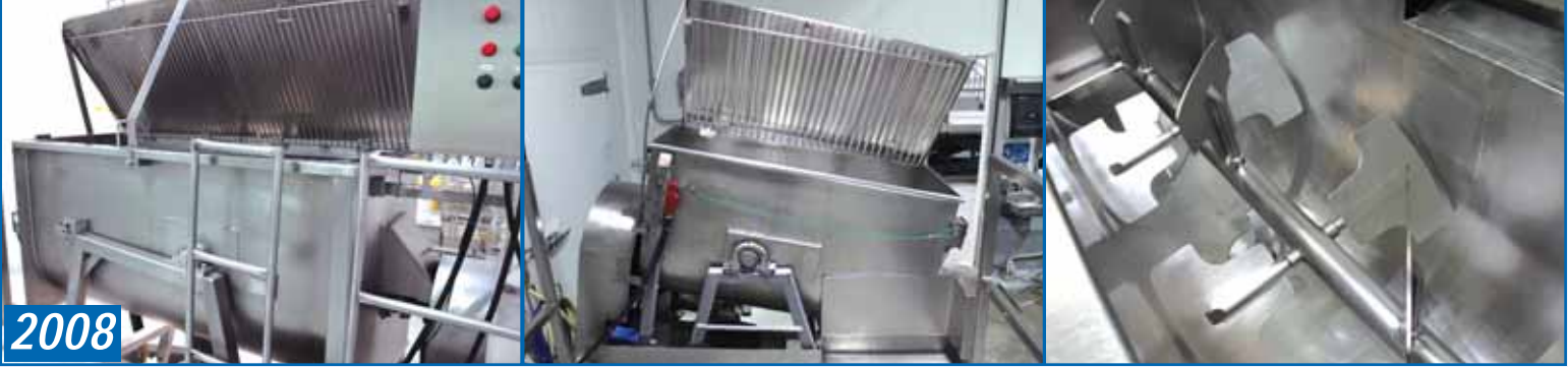
2008 SS SINGLE SHAFT PADDLE MIXERS – 30" X 78" X 40" DEEP AND 24" X 48" X 30" DEEP