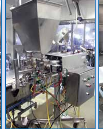
HAUSSER TWIN HEAD DEPOSITOR