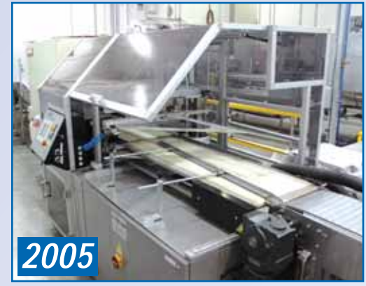
COMPAK CM50-2NSRL FLOW THROUGH SHRINK WRAPPER