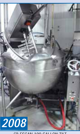
(2) ESCAN 100 GALLON TILT SCRAPE KETTLES