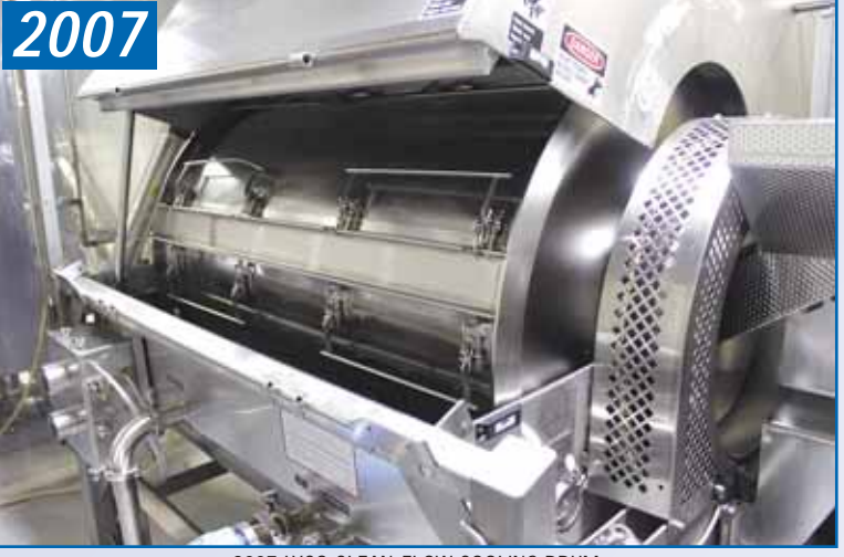
2007 LYCO CLEAN-FLOW COOKER