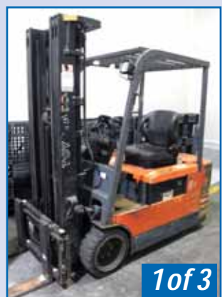
TOYOTA ELECTRIC FORKLIFTS