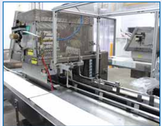
(2) NORDALE HORIZ HOT MELT CARTONERS