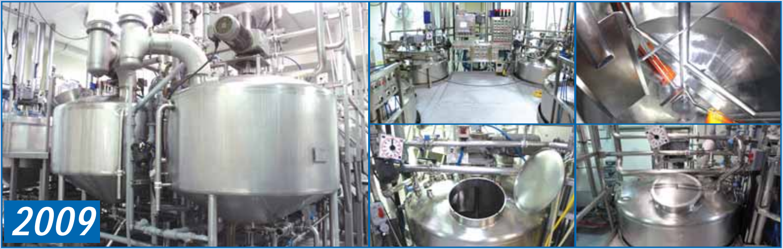
SAUCE COOKING SYSTEM - (6) INDUSTRIES D'ACIER 400 GALLON JACKETED PROCESSORS, DOUBLE MOTION SWEEP SCRAPE WITH BAFFLES, 75 PSI JACKET