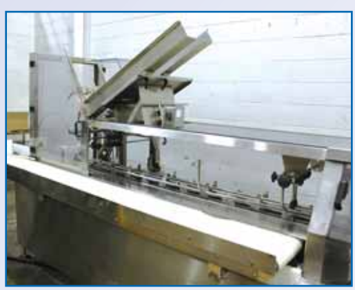
CONSOLIDATED TECH HORIZ HOT MELT CARTONER