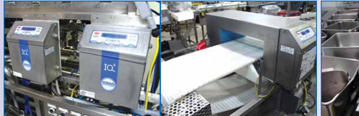
LATE MODEL LOMA IQ2 PIPELINE AND CONVEYORIZED METAL DETECTORS