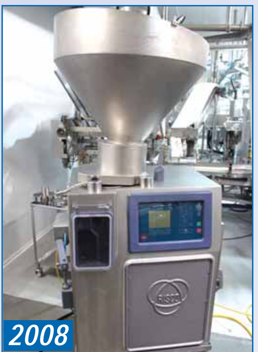
2008 RISCO RS 205/80 VACUUM STUFFER