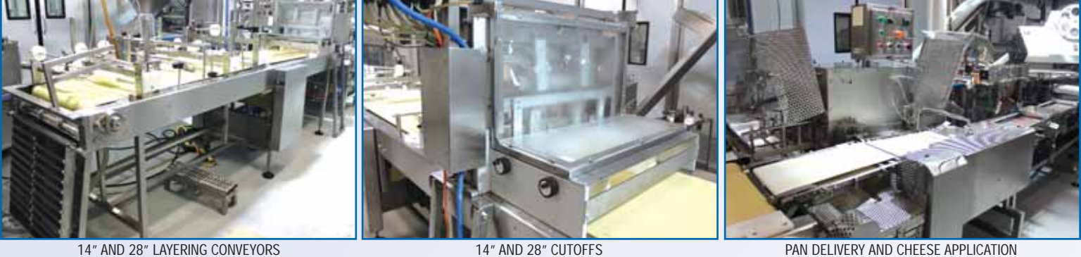
14" AND 28" LAYERING CONVEYORS