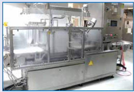
TRAY AND PAN SEALERS