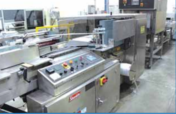
2) SHANKLIN F-5AH SS FLOW THROUGH SHRINK WRAPPER