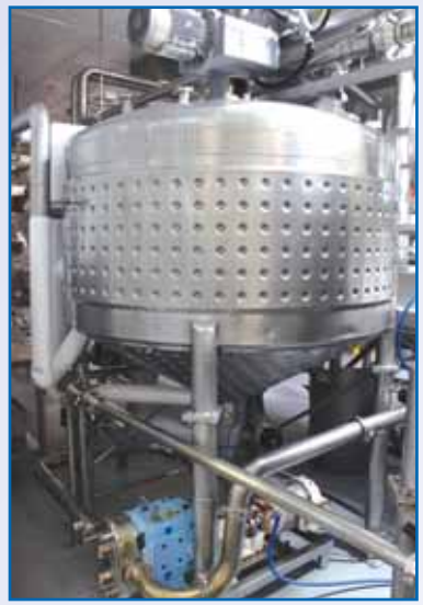
(2) ELLET SWEEP SCRAPE PROCESSORS