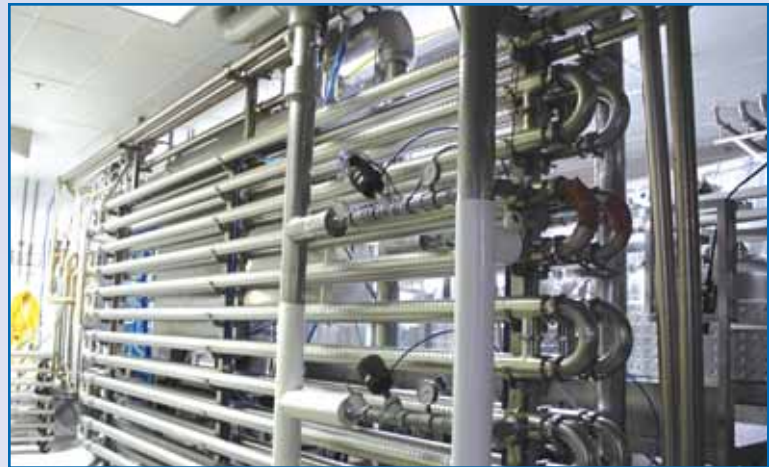
WAUKESHA CB 12-PASS SS TUBE IN TUBE PASTEURIZER