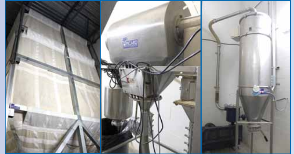
PICARD FLEXIBLE POWDER SILO WITH ROTARY SIFTER AND DUST COLLECTOR